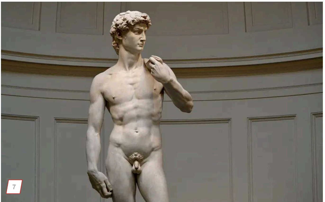
The original 16th century statue of David by Italian artist Michelangelo Buonarroti stands in the Galleria dell'Accademia in central Florence.