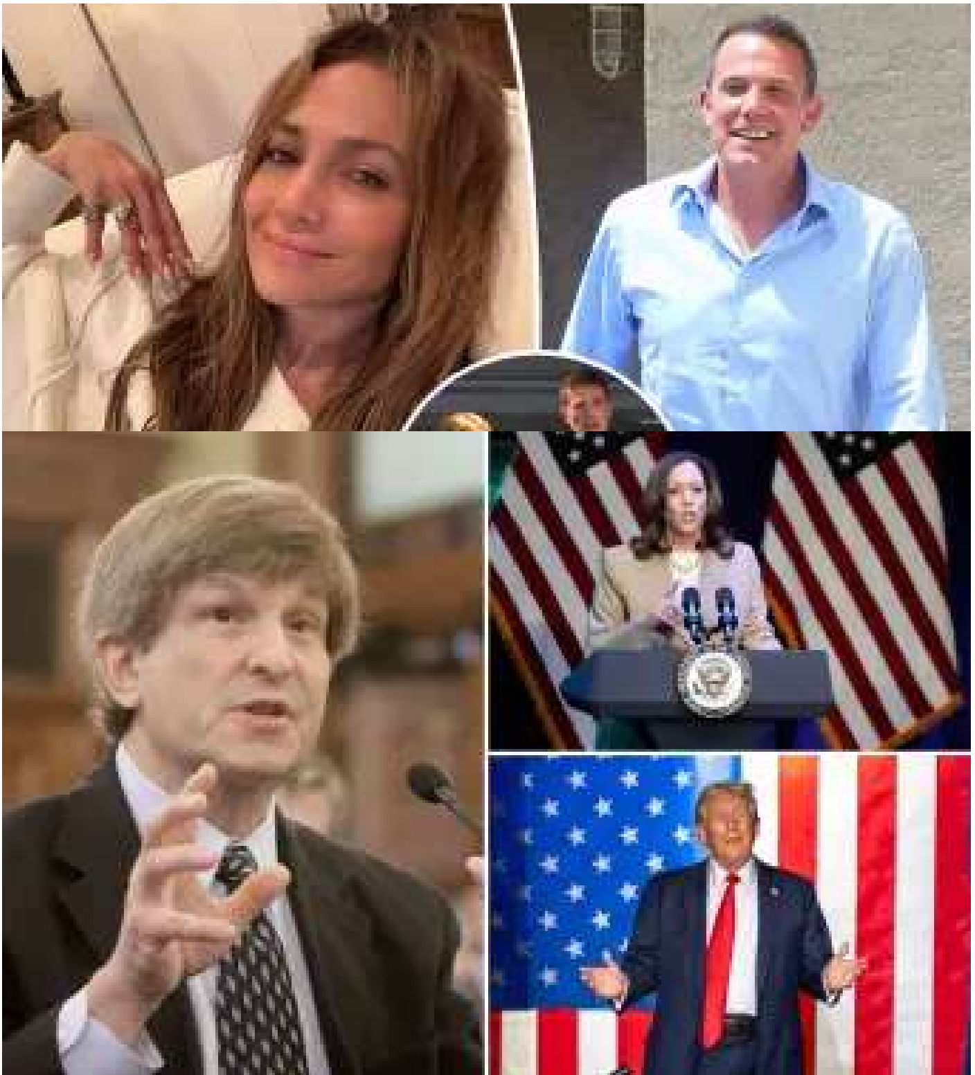
Historian who predicted almost every election since 1984 gives take on Trump-Harris matchup