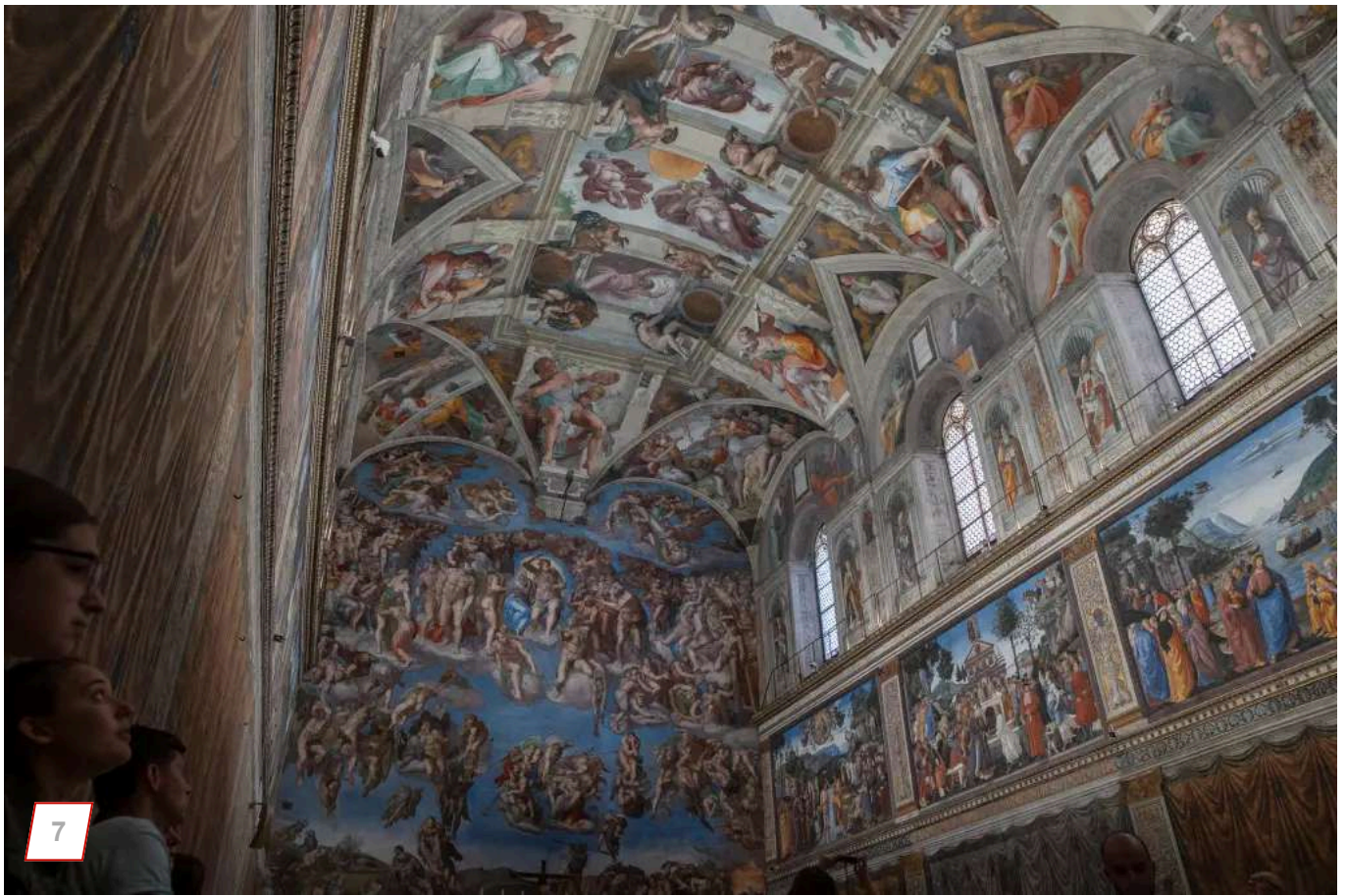
The ceiling of the Sistine Chapel.